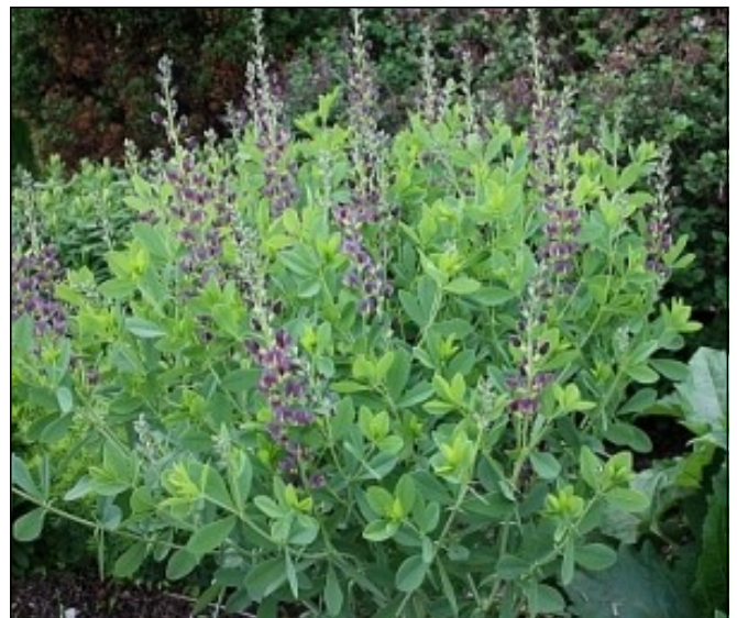
Baptisia Twilite Prairieblues™