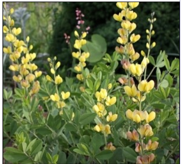
Above and right: Baptisia 'Solar Flare' in the author's garden

Baptisia Twilite Prairieblues™ (botanical name is Baptisia ×variicolor 'Twilite' PPAF) is a cross between B. australis (our PPA winner) and B. sphaerocarpa - a shrubby, tough little guy with yellow flowers. This fortuitous romance yielded quite a jaw-dropping color combination of dusky violet with a yellow keel petal. Look for them in the Hahn Horticulture Garden along the paved path near the xeriphytic border. Last year's bloom time was mid-May through the beginning of June.