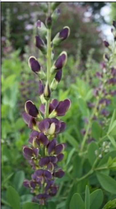
Baptisia Twilite Prairieblues™ in the Hahn Horticulture Garden

Baptisia 'Solar Flare' (also marketed as Solar Flare Prairieblues™ False Indigo - yeesh) is an open-pollinated hybrid complex of B. alba (white-flowered), B. tinctoria (yellow-flowered), and B. australis . This is what can happen when a whole bunch of species and hybrids are planted close together (cocktails and/or bees are usually involved). A June bloomer, buttercup-yellow fades to warm apricot, then to plum - the flower spike absolutely glows in the late afternoon sunshine. Both of these hybrids are drought tolerant once established, tough as nails, hardy to USDA Zone 5, and deer resistant. Part of the drought-tolerant mechanism is a long tap root; Baptisia generally resents transplanting (or is at least slightly indignant).