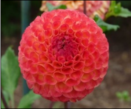
Dahlia 'Ginger Willow'

some turf at the front of the garden, as human traffic seems to want to walk there, bed or not. We liked the turf paths in the conifer garden so much that we decided to use them in this space as well. The space is fairly wide in spots so we felt having a path system would help with accessibility of interior specimens and reduce bed trampling. We've begun to fill this space but will continue to flesh it out in the coming year.