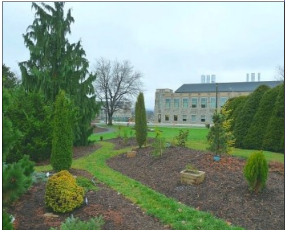
Expansion of the conifer display.

Another area of revitalization was the front corner of the garden on Washington Street. Giant sunflowers and hibiscus had taken over, so we decided it was time for a little facelift. Again, destruction ensued and the front corner was left naked while a plan for the area was devised. We ultimately decided to pare down this space and replace